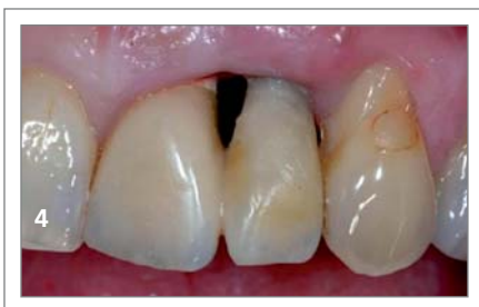
Fig 4. Poor aesthetic result after the placement of two adjacent implants

If root canal treatment fails, it may be possible to re-treat the tooth either surgically or non-surgically. If that fails, the tooth would then have to be extracted.