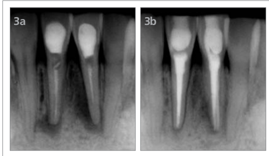
Fig 3a Inadequately root filled teeth showing infection at the root tips

provided this is done by a specialist with the requisite skill, experience and equipment. (Figs 3a + 3b)