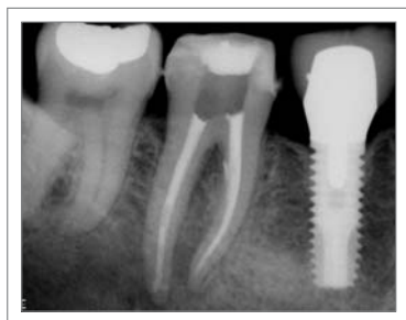
Fig 1. Implant By Dr Michael Zybutz: Root canal treatment by Dr Tony Druttman

The implant is a titanium screw that is placed into the jawbone to which an artificial crown can be attached (Fig.1). It is designed to replace the natural tooth, both in terms of function and aesthetics. It requires an adequate quantity and quality of bone for the implant to become secure. If there is insufficient bone then various additional procedures may be required to enhance the amount of the existing bone, such as grafting natural or artificial bone.